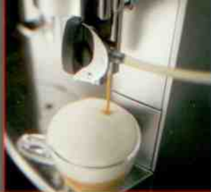
One Touch Cappuccino, One Touch Latte Macchiato