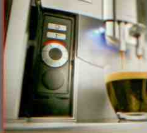
Coffee à la carte