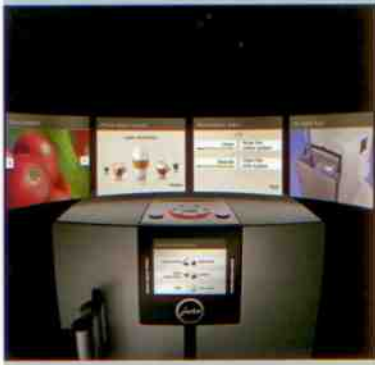
TFT display with Rotary Selection