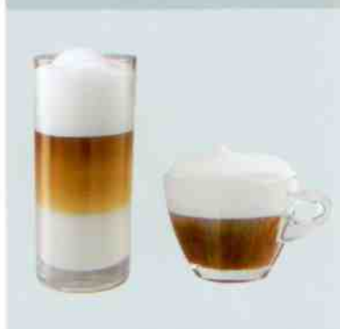
Revolutionary fine foam technology